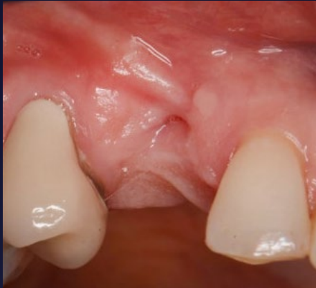
3 weeks healing post extraction