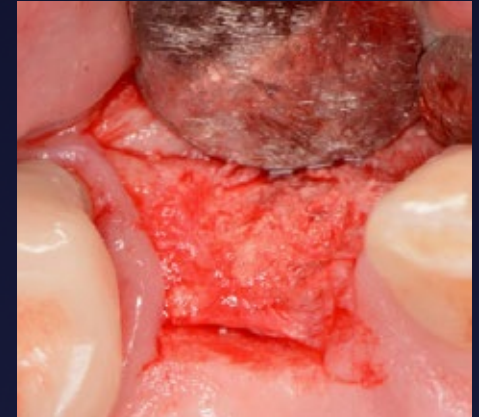
New bone formation at 12 weeks - grown over implant