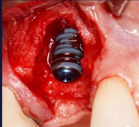
Implant placement & palatal graft