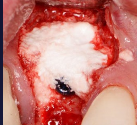
Simultaneous buccal graft