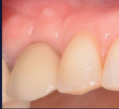
Loaded 1 year